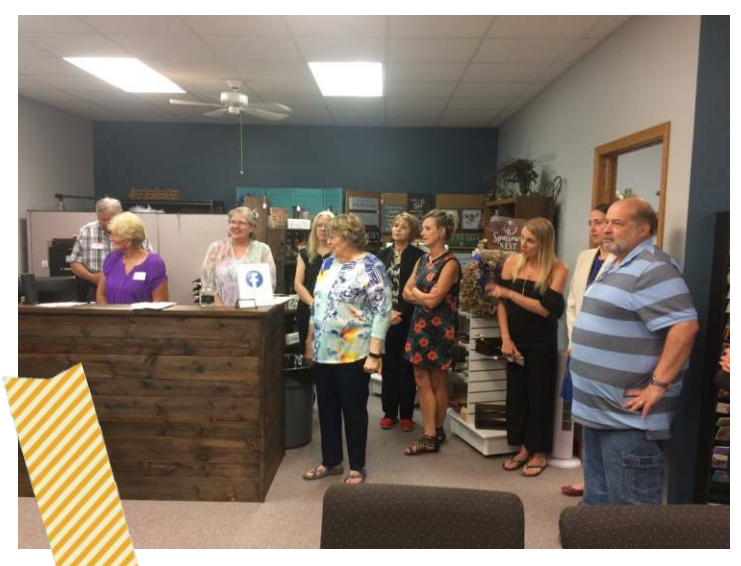
Folks gathered in front of the Sparrow's Nest gift area and reception desk