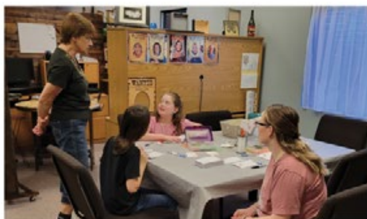
A couple busy customers working on the activity