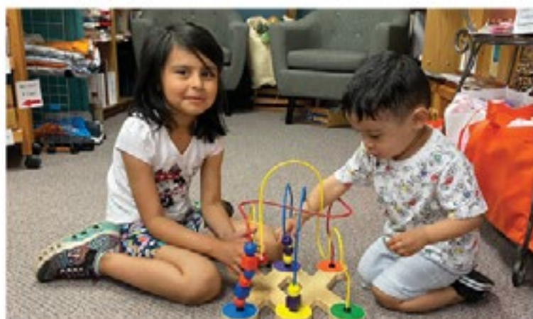
Some found playing to be more fun!