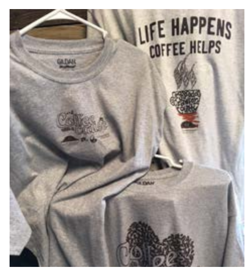
We had T shirts for the occasion, and have some on sale at Sparrows Nest if you'd like one! Thank you for your help and expertise, ID Apparel!