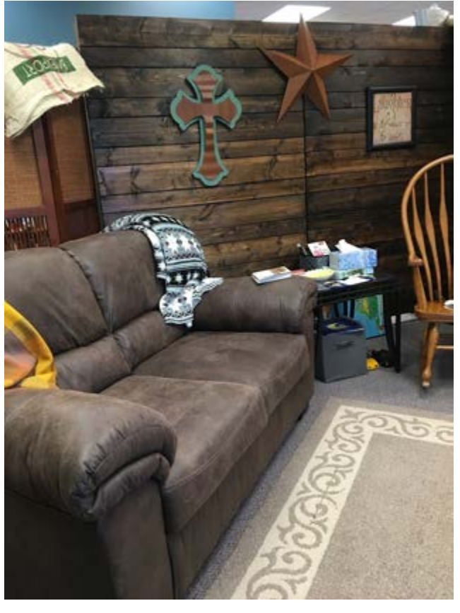
The Family Den - This is a family-friendly area that feels more like a small living room, with the intent of making parent-child or family discussions more comfortable and doable when a home setting is not an option. Call us if you would like to inquire about availability for any family meetings!