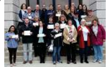
Photo: Receiving of check from Omaha Foundation/Crawford County