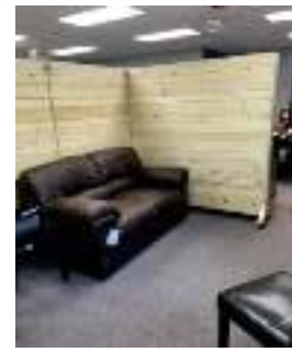
The area outside of the den with plenty of bulletin boards & storage space which is all portable, with casters.