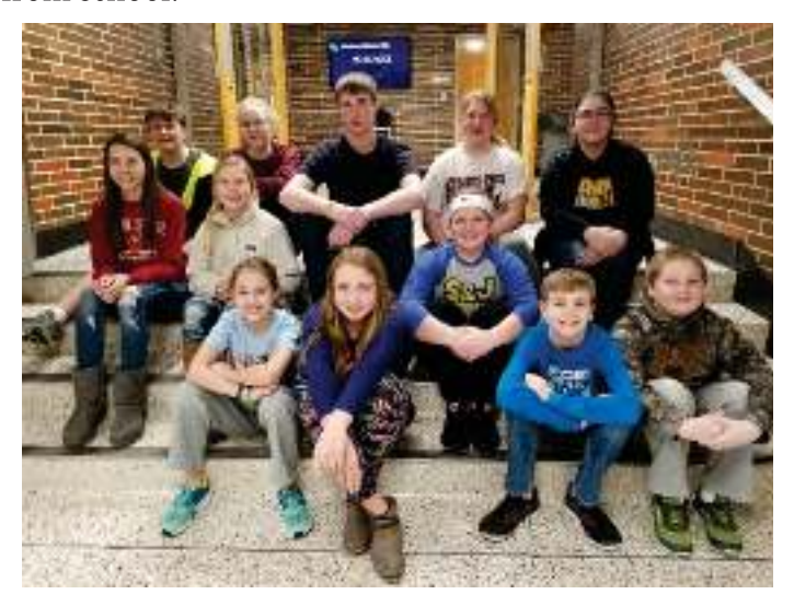
Pictured here are the students from 7th and 8th grade in Schleswig who made a difference by a bit of running and a genuine smile:

The Schleswig TAG grade students have been terrific help this year in delivering Meals on Wheels to Schleswig residents. About half a dozen adult individuals have been willing to drive to pick up the meals. Then 2 students from the school, would bring the meals from the vehicle to the person's door so that it would run most efficiently. Our seniors receiving the meals enjoyed the students' bubbly smiles, and the students typically reported enjoying the break away from school!