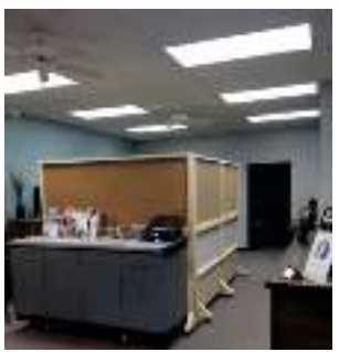
Kessel Construction designed & built our walls. They are very practical, sturdy and beautiful!