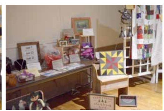
Some of the donated auction items

The auction items reflected that same message. Most projects had the symbolic significance of beginning with something in pieces, useless, broken, or unvalued. With the crafter's skill and workmanship, the pieces were turned into beautiful and valuable items. This is how God works in our lives as well!