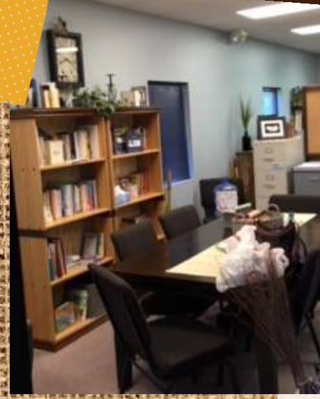
Conference table & book shelves. The shelves have many resources we want to share with the public. Topic areas include marriage, strengthening family, parenting, Christian living, devotionals, and healthy living.