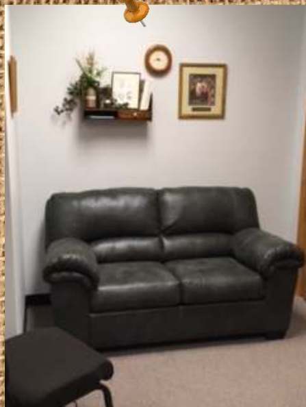
Waiting & reading/lounging area