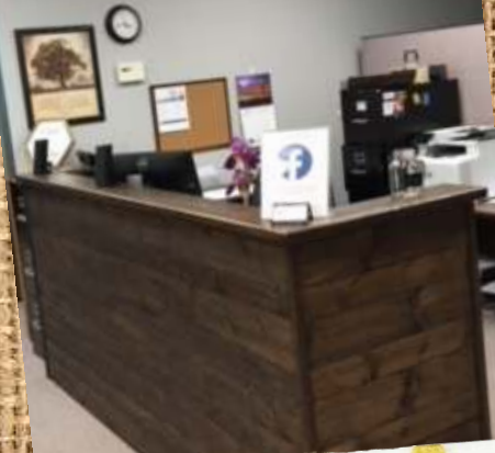
as you come into the front door