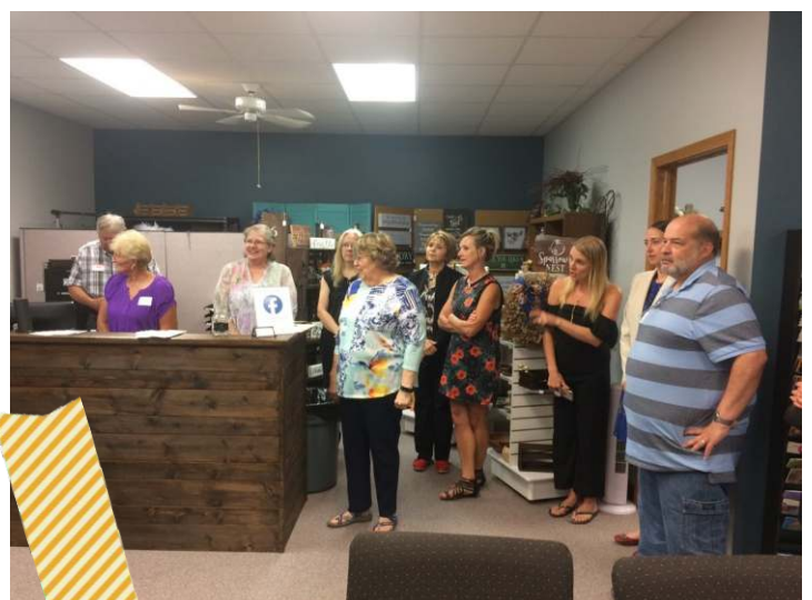
Folks gathered in front of the Sparrow's Nest gift area and reception desk