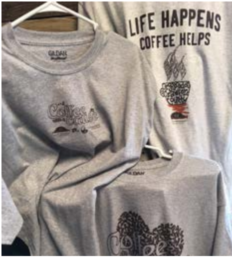
We had T shirts for the occasion, and have some on sale at Sparrows Nest if you'd like one! Thank you for your help and expertise, ID Apparel!