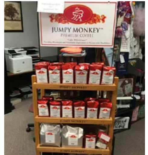
Only a couple bags of coffee remained after the coffee bash, and the re-order has just arrived and already, several are sold. The coffee is vacuum packed in whole bean or ground varieties. We will keep some of most kinds on hand, but to assure freshness, we will order regularly and notify you when it arrives!