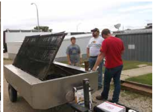
Here are some pics of the outdoor activities we had at the fundraiser. Heavy rains moved everyone inside quickly, except the Crawford County Cattlemen who stuck it out to bring us awesome steak sandwiches, burgers, and hot dogs...TRIPLE THANK YOU, Cattlemen (for grilling, donating, AND doing so with a smile in the rain!)